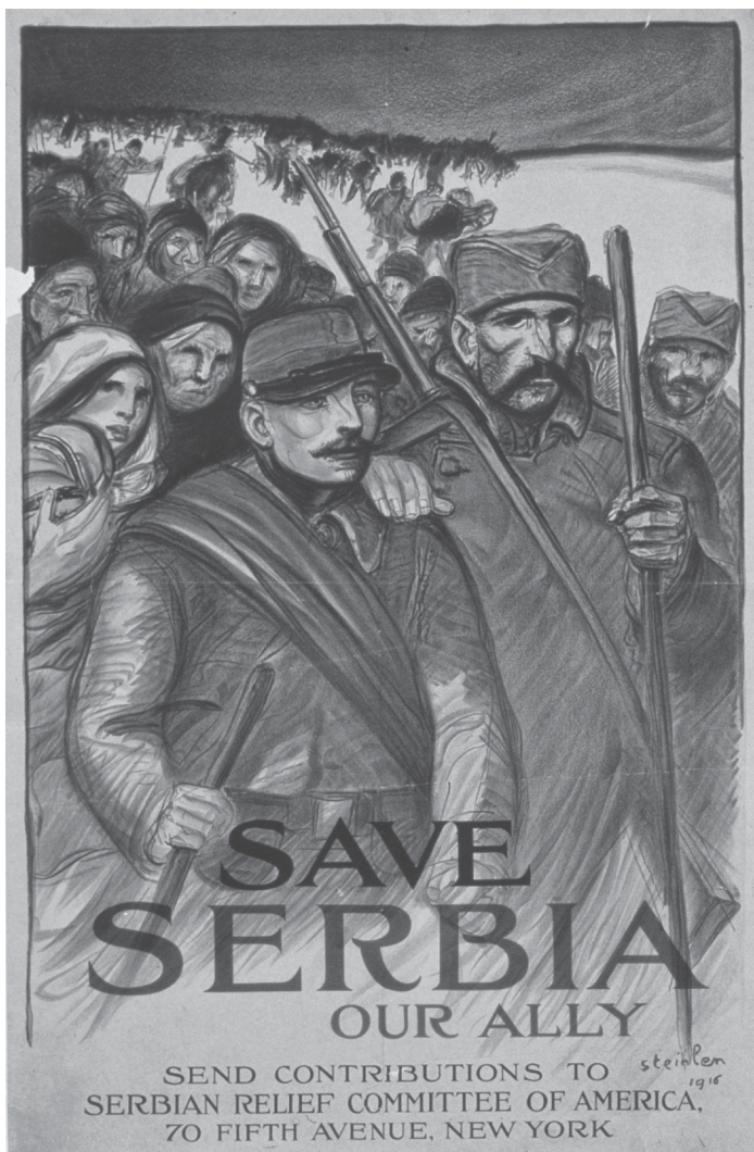
■ The Save Serbia propaganda poster, USA, 1915.

louse responsible for transmitting the disease and that the epicenter in Serbia was in the town of Valjevo, where most of them were concentrated. 2