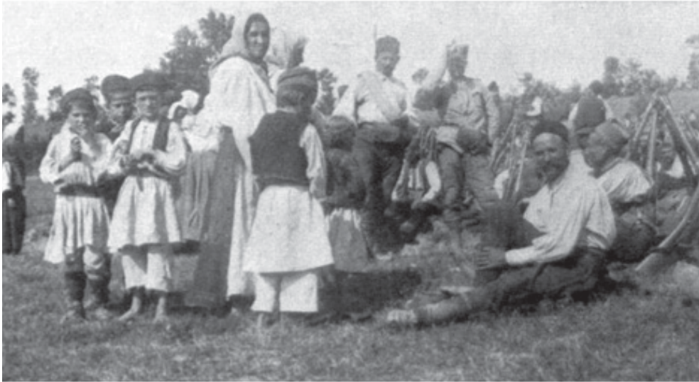
■ Refugees asking for bread.

reached the countryside, generating a situation that was getting out of control.